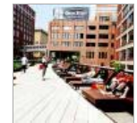
The High Line opening