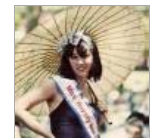
Jazz Age Lawn Party