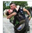
Return to Punk Island