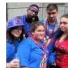
Puerto Rican Day Parade