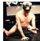
Air Sex Championships