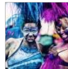
Mermaid Parade 2009