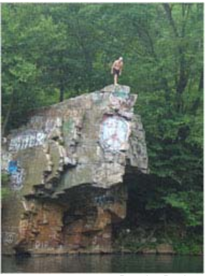
Douglas Paulson Artist Ward Shelley on a "Going Places, Doing Stuff" tour.

Get your tickets now! The second season of "Going Places, Doing Stuff," artist-led road trips that are organized by the Flux Factory, begins this weekend. The drill: you sign up for a tour, board a bus — in this case, a vegetable oil powered school bus – with a few dozen fellow adventurers, and are taken somewhere, where you do something, none of which is revealed to you beforehand. (Past adventures have included going to a blueberry farm, an old mining town, and a novelty diner that's home to a 50-pound burger.)