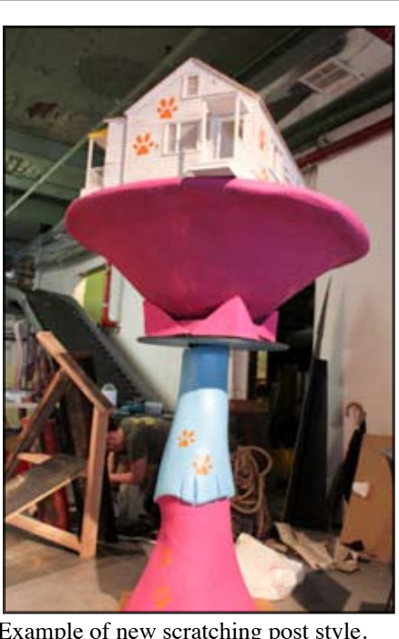
Example of new scratching post style.